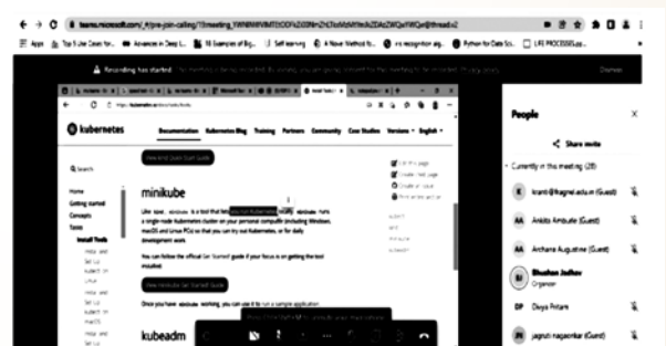
Introduction to Advance Cloud Computing, Docker and Kubernetes

situation the entire FDP was managed and hosted on online platform via video conferencing.